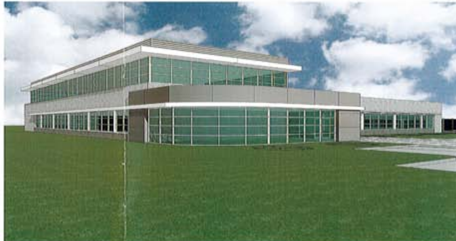
NORTH-WEST CORNER (GROUND LEVEL)