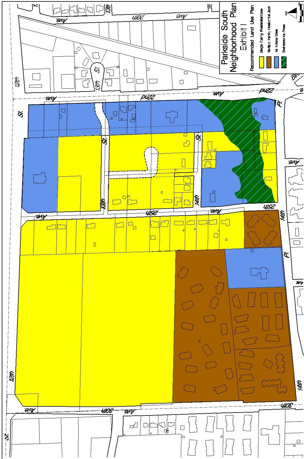
Exhibit I - Recommended Land Use Plan